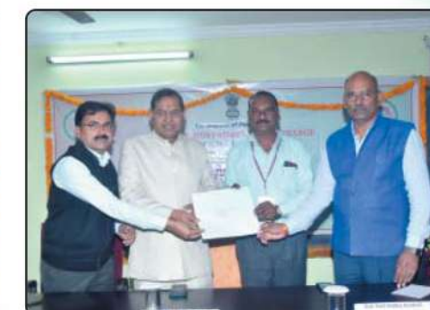
NAAC Team Report