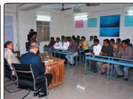
NAAC Team interaction with Alumni