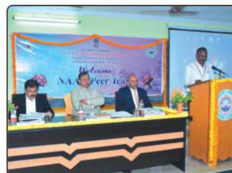
NAAC Team Visit