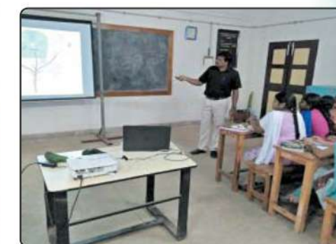
Digital Class Room