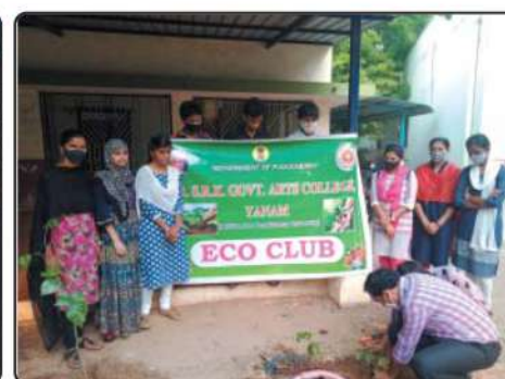
Eco Club activities