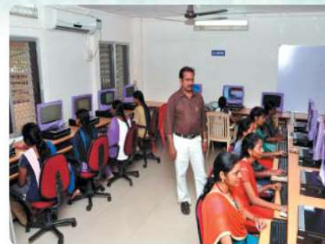
Computer Science Lab