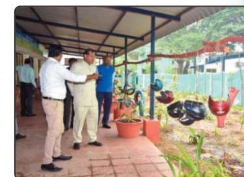
NAAC Team at Waste Management