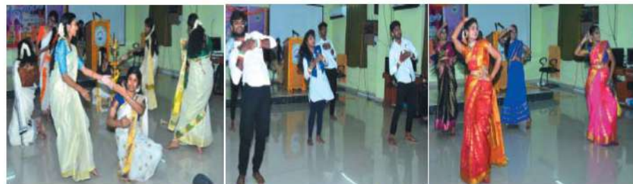
Cultural Programmes by students

* Dr. SRKGAC, Yanam Won the Team Championship